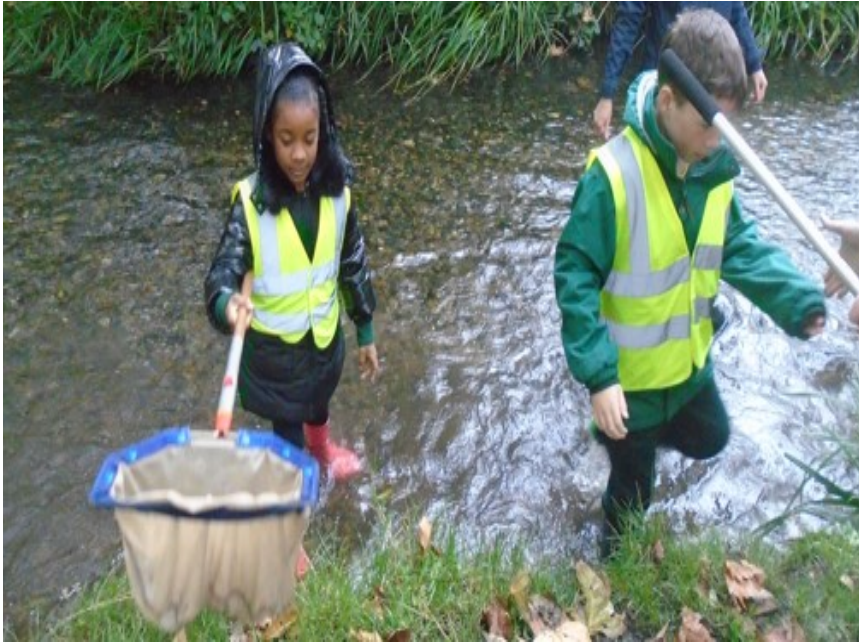
Year 4 at The River Wandle